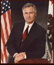
About Congressman McClintock

Congressman Tom McClintock began his public service in the California State Assembly in 1982 at just 26 years old and went on to serve more than two decades in the legislature, earning recognition as a leading advocate for fiscal discipline, tax relief, and individual liberty. Since 2009, he has represented California in Congress, where he has built a record as a principled defender of constitutional government. From advancing policies on fiscal responsibility, water and forest management, and border security, to consistently standing for limited government and free enterprise, McClintock has remained one of the nation's most respected conservative voices, dedicated to protecting the freedoms and values that define America's success.